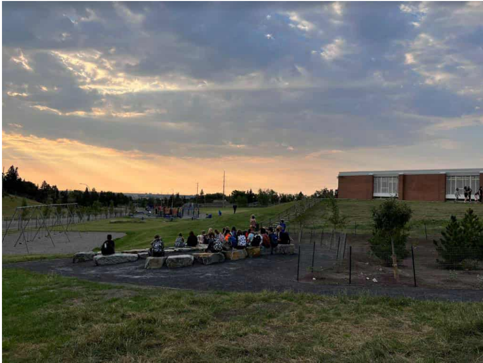
Initial student use on the first day of school September 1, 2022.