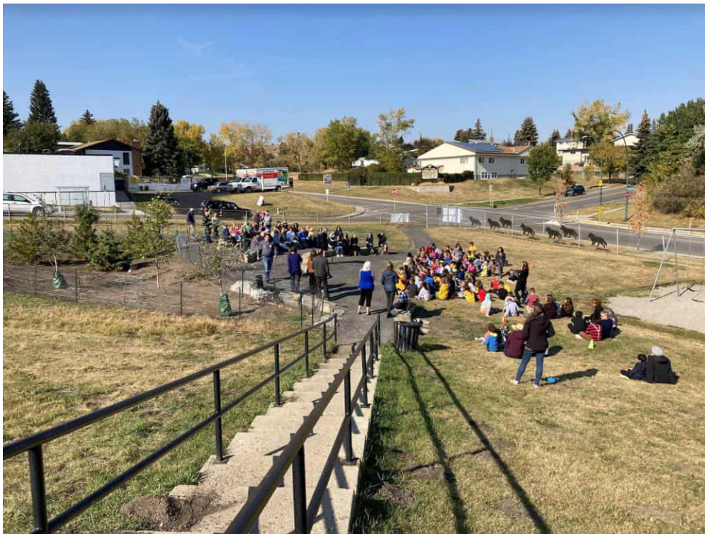
Grand Opening event with students, school staff, volunteers, community members and sponsors. October 6, 2022.