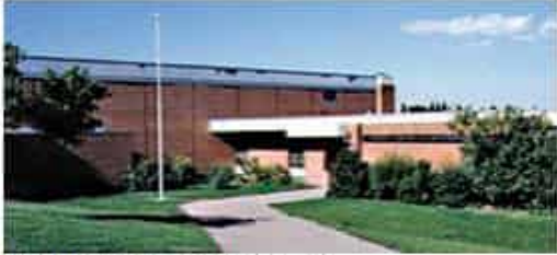
North Haven Elementary School

2021 April is when the school-wide project first started. Teachers and students decided to start a naturalization area at the school. The students were asked to draw a design of what they wanted in the naturalization area. Then they had to write persuasive paragraphs to go along with their drawings to tell how the design would enhance learning at North Haven School.