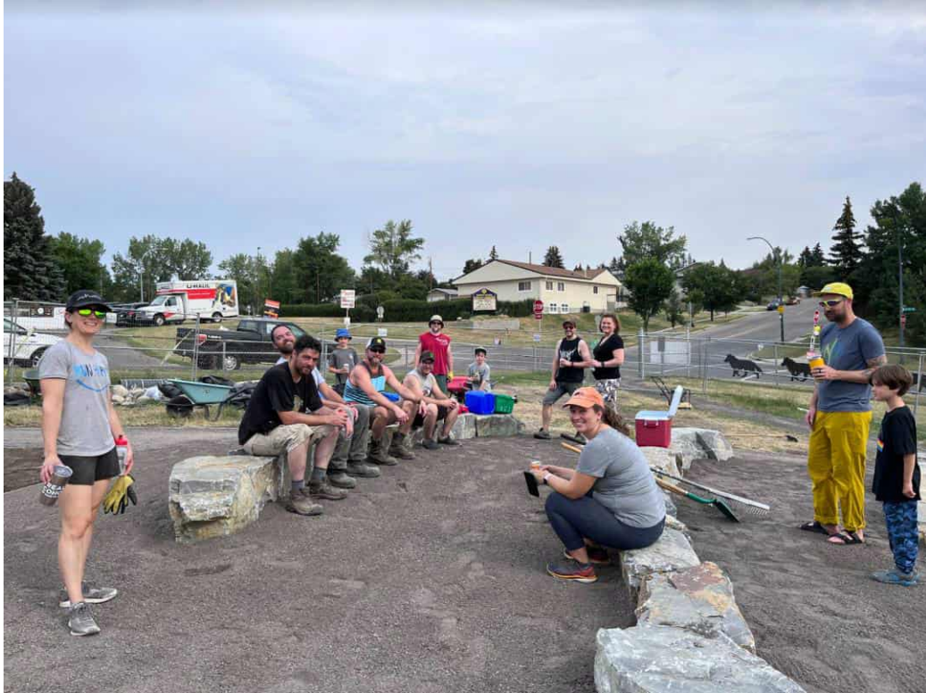
Well deserved break after volunteer gravel placement August 20, 2023.