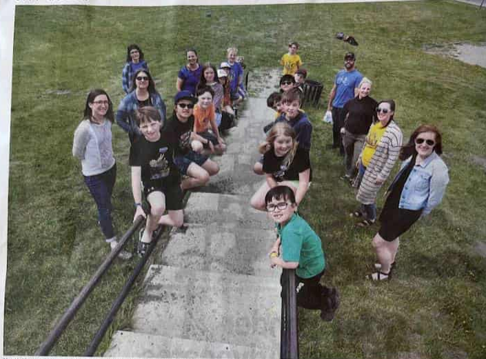
North Haven School parents and students get together Friday near an area of the schoolyard where they are fundraising to build a mini park next to their school in hopes of attracting more students to keep the school open. The project includes paths, vegetation and an outdoor learning space. CASIN YOUNG