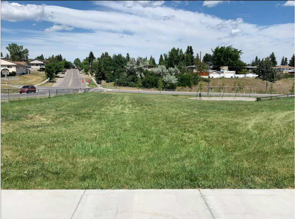
Before construction, view facing north. June 22, 2021.