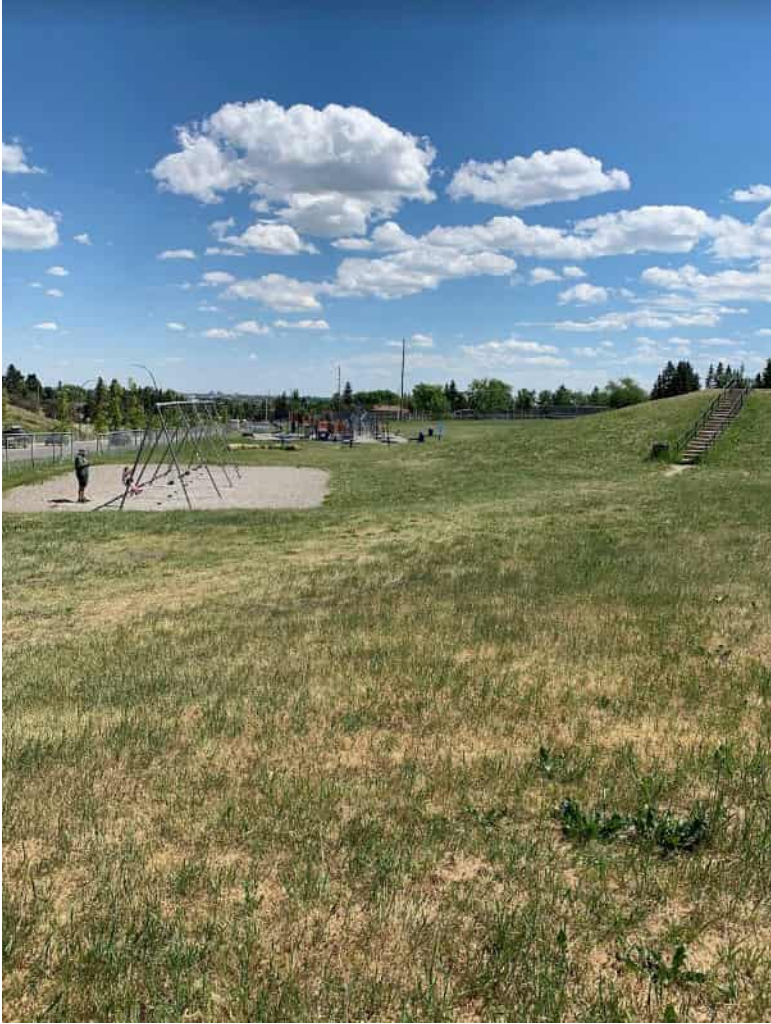
Before construction. View facing east. June 22, 2022.