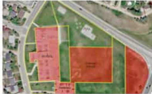
North Haven students planning sheet

The students put together a proposal for a grant for flowers for the front flower bed in the front of the school. In June, the students used the grant money to enhance the flower bed and soil. After this they did projects about specific things they wanted in the naturalized area.