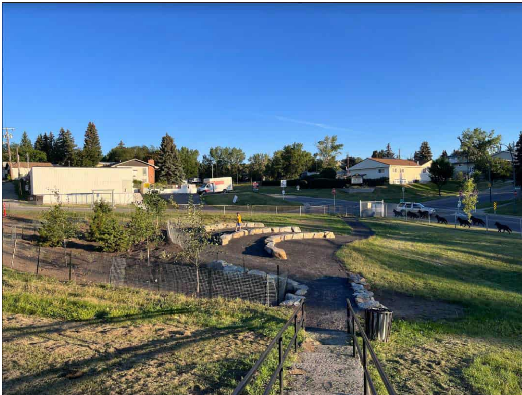
Construction fence down and ready to explore! North Haven Learning Grounds August 31, 2022.