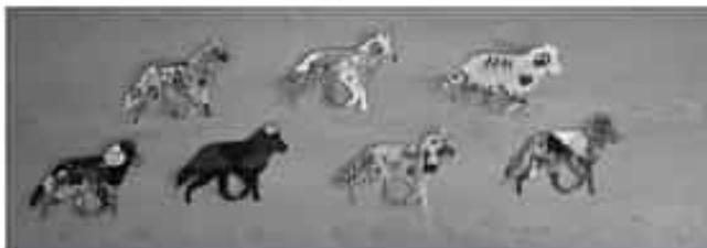
Each class made a draft of their final wolf for the outdoor mural.

The school is excited to see the finished product on June 10 and can't wait to see what you think of the finished project.