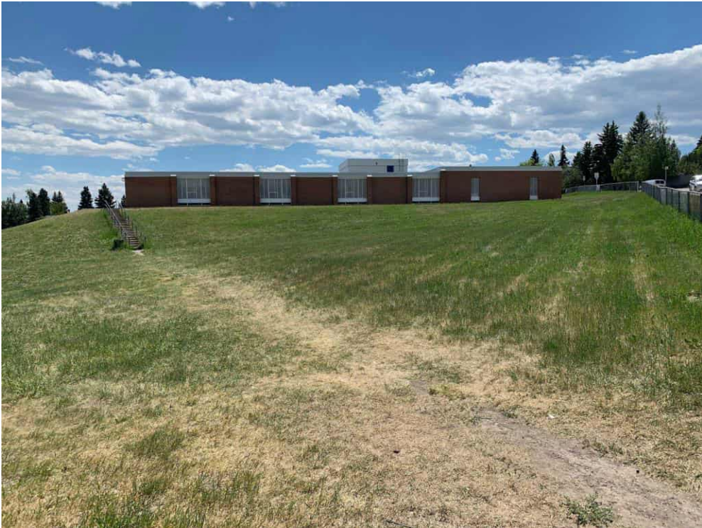
Before construction, view facing south. June 22, 2021.