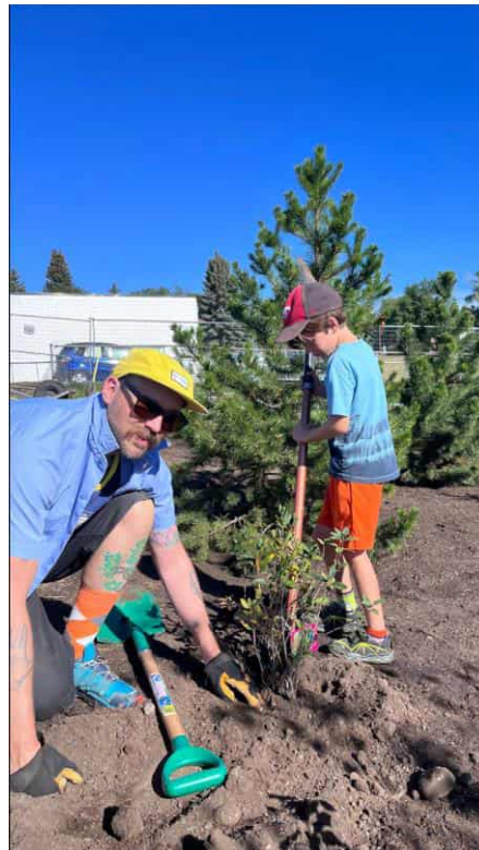
Preparation for, and work at volunteer planting event August 13, 2022.